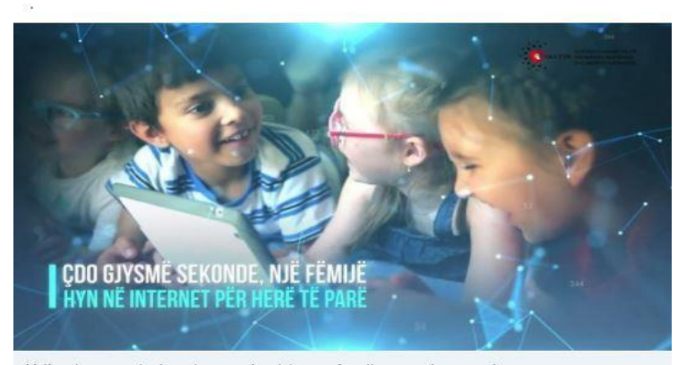
Udhezime per industrine e mbrojtjes se femijeve ne Internet! youtube.com

"This video has been developed as part of a collaboration agreement with the International Telecommunication Union within the context of ITU's global programming on child online protection."