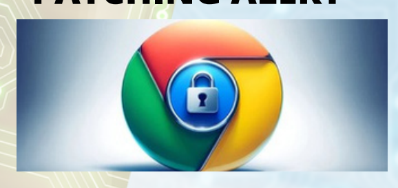
Google - patching alert

Google has released updates to fix 4 security vulnerabilities in its Chrome browser, including an actively exploited zero-day vulnerability.