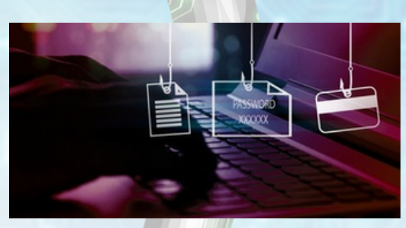
LockBit Ransomwa<mark>re adds tw</mark>o new victims to the Dark

GThe LockBit ransomware group has added two new victims to its list - Maisons de l'Avenir in France and Shinwa Co in Japan. The threat actors have given a strict deadline for their demands, set at February 4, 2024.