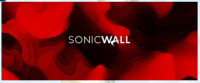
Over 178 firewalls vulnerable to DoS attacks

Security researchers have discovered that more than 178,000 SonicWall next-generation firewalls (NGFW) are vulnerable to denial-of-service (DoS) attacks and possible remote code execution (RCE) attacks.